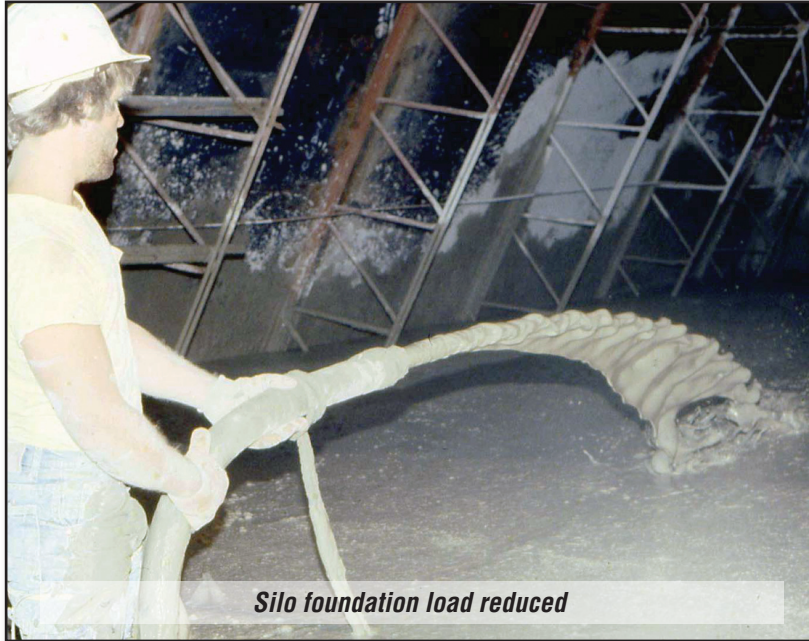
Silo foundation load reduced

Elastizell EF fills the voids (seen in orange at right) behind the sloping discharge hopper plates and the slipformed silo wall.